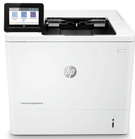
HP LaserJet Managed E60155dn

Dynamic security enabled printer. Only intended to be used with cartridges using an HP original chip. Cartridges using a non-HP chip may not work, and those that work today may not work in the future. http://www.hp.com/go/learnaboutsupplies